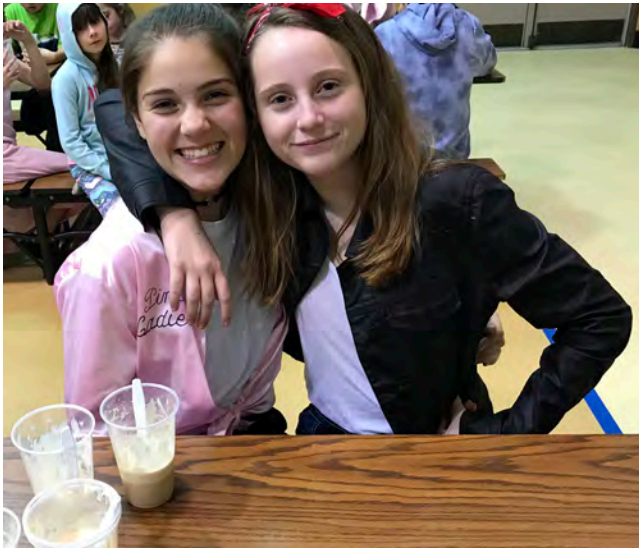
Celebrating our History through the years!