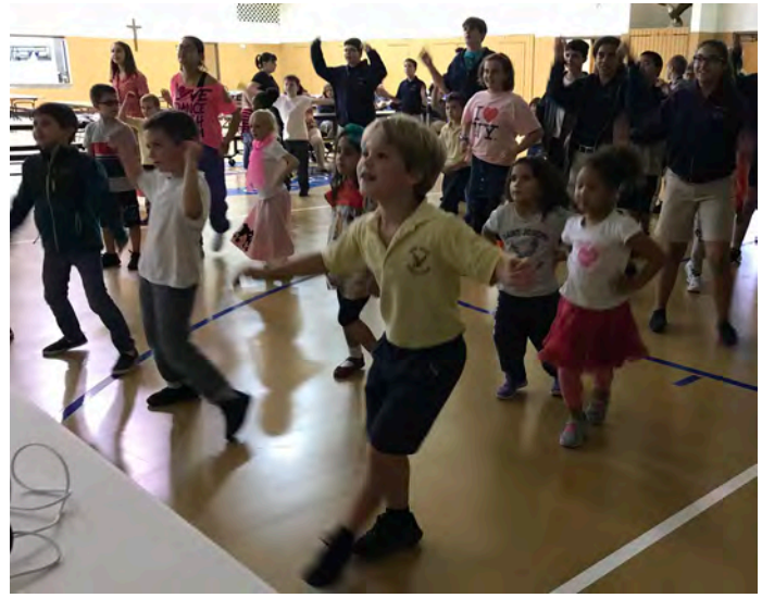
Dancing through the Decades!