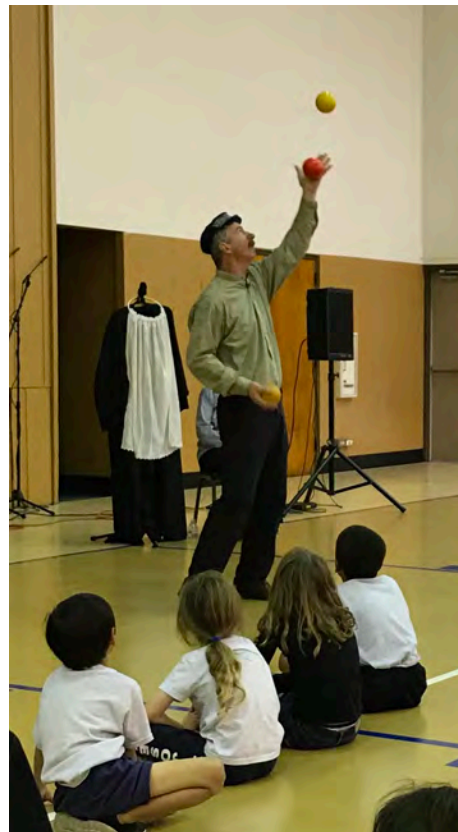
Celebrating Vocation Day with a visit from St. Don Bosco